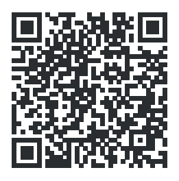
Scan this code to read this information online